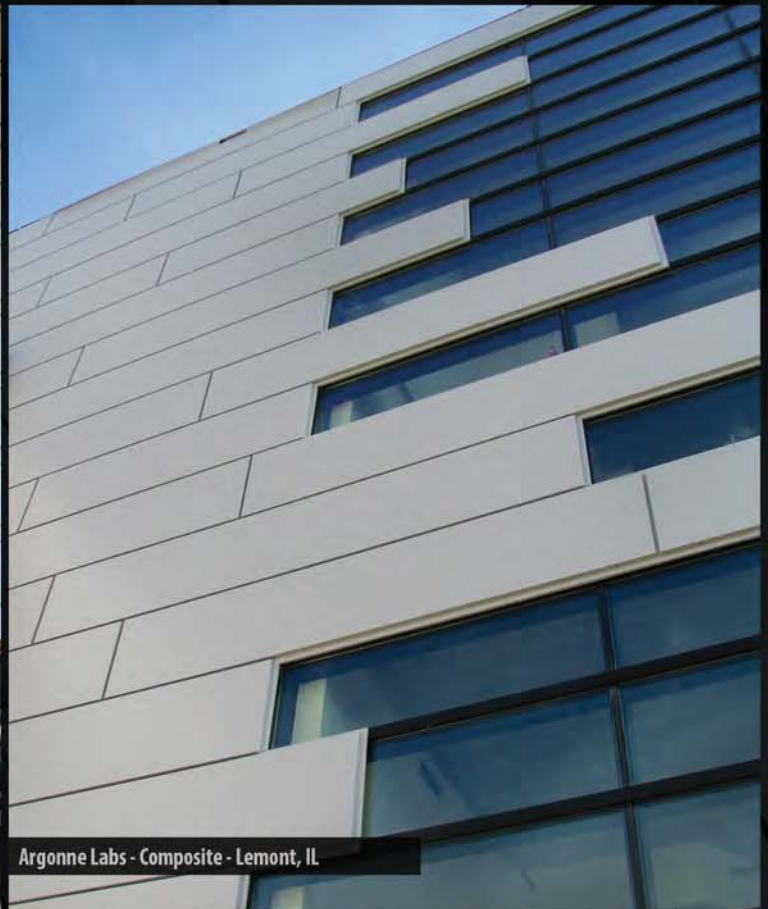
Argonne Labs - Composite - Lemont, IL