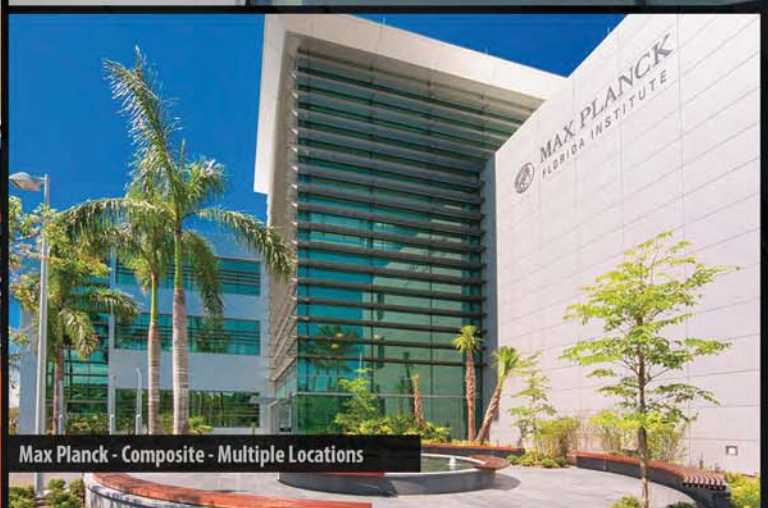
Max Planck - Composite - Multiple Locations