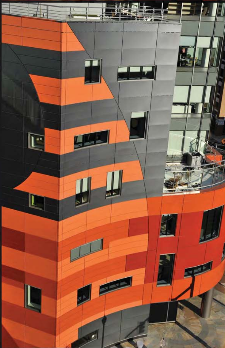
United Therapeutics - Plate - Silver Springs, MA