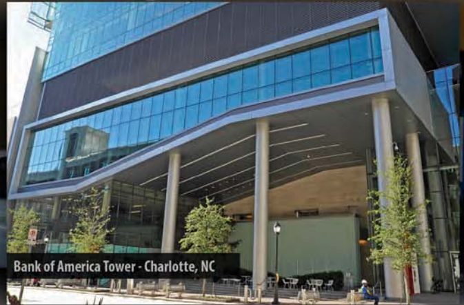
Bank of America Tower - Charlotte, NC