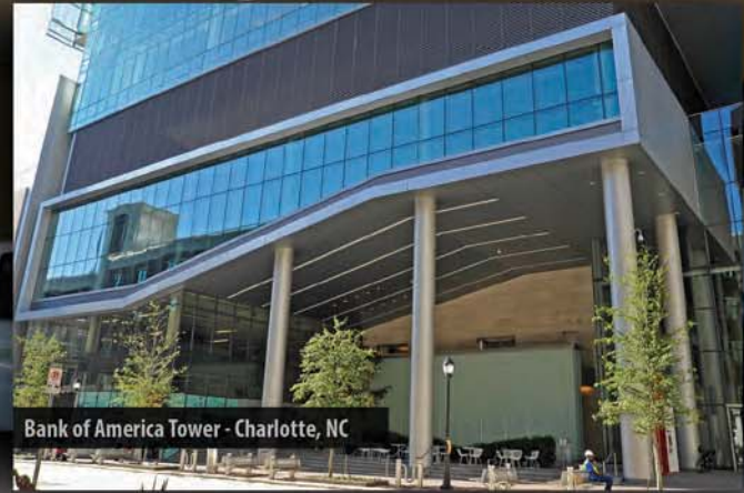
Bank of America Tower - Charlotte, NC