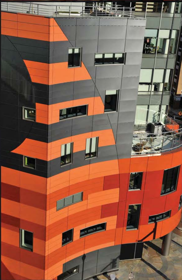
United Therapeutics - Plate - Silver Springs, MA