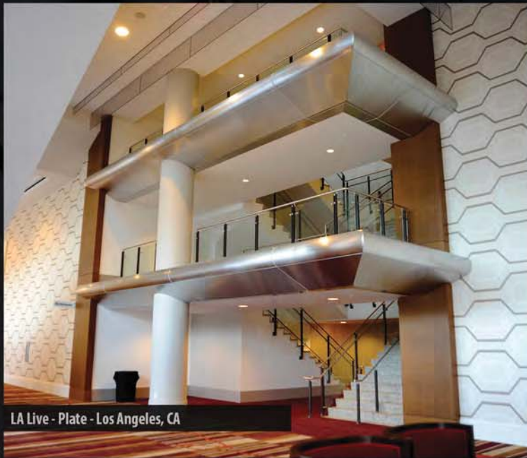
LA Live - Plate - Los Angeles, CA