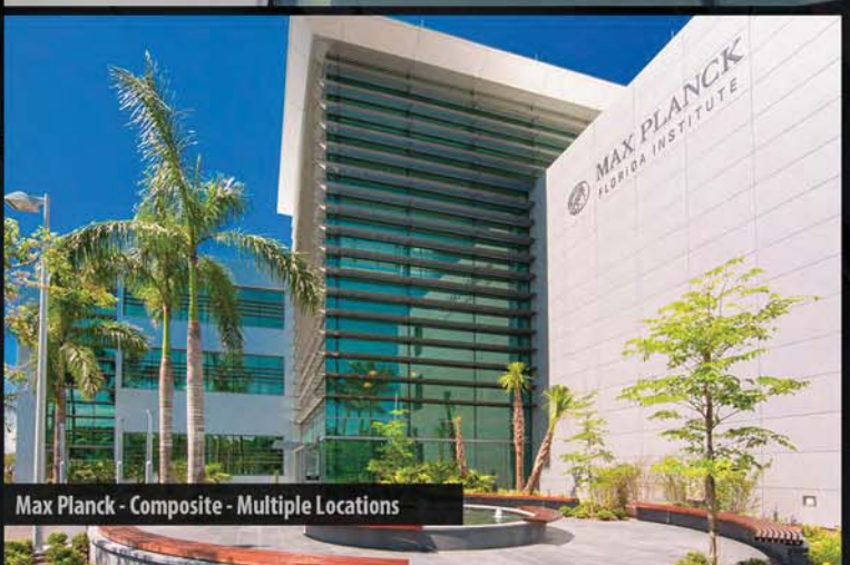
Max Planck - Composite - Multiple Locations