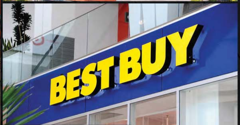
Best Buy - Composite - Multiple Locations